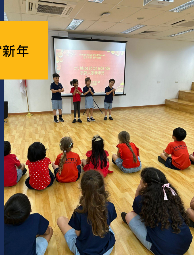
Year 2A FCL Doing a sing along “新年 好 xin nian hao”