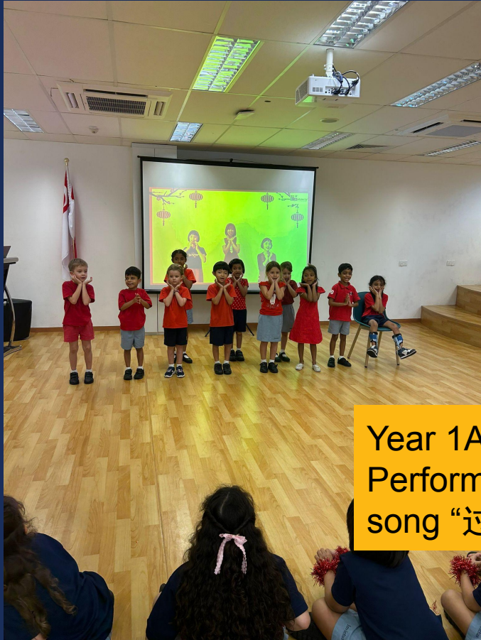
Year 1A FCL Performing a dance to the song “过新年 guo xin nian”